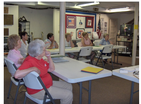
Members and guests attending one of the genealogy workshops held at the Museum

The Marshall County Historical Society had a very busy and productive year in 2010. Some of the events the society participated in are the Marshall County Home and Business Expo in March, West Virginia Day in June and the Elizabethtown Festival in September. Many thanks to the members who arranged the displays and staffed the booths at these events.